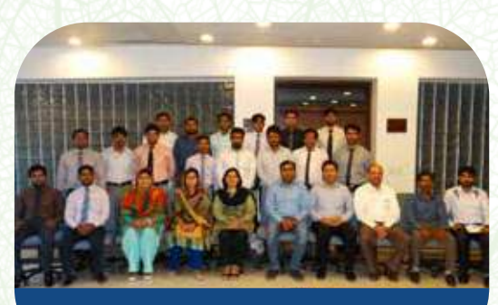
Assessment & Functional Training for LO, GL (KB-215) May 02-05, 2017, NIBAF Islamabad