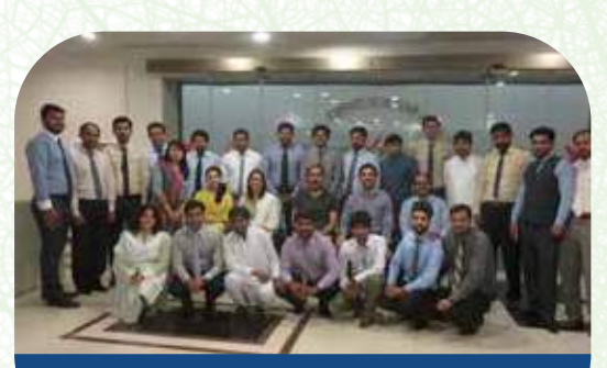
Assessment & Functional Training LO-MSME (Batch-28) May 8-12, 2017, NIBAF